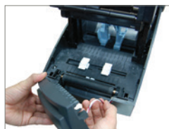
Auto-Cutter : Easy installation