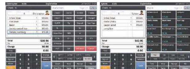
▲Standard type application