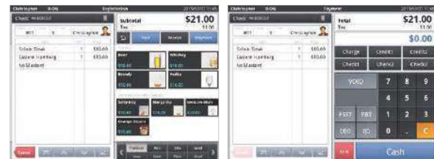
▲New simple type application

Casio has a long history of supplying cash register products. V-R100 can select from two types of sales management application. One is the traditional type for those who are familiar with the cash register operation. The other is a new operation type for inexperienced users. Whichever application is chosen, sales data and stock data can be easily managed and reported.