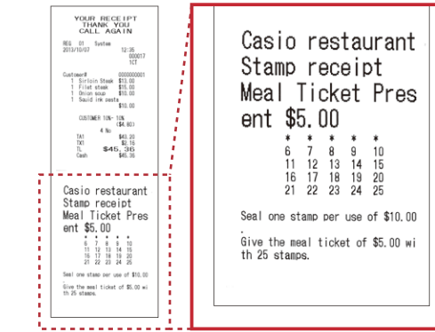
▲Electronic stamp card

V-R100 has a simple point stamp card system which enables to print on the receipt. A voucher can be issued according to the number of store visit. This feature will help provide better service for preferred guests.