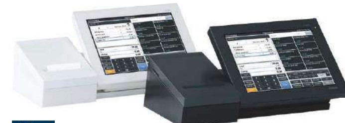
▲LCD screen in upright position

V-R100 is very compact. Small footprint will enable to fit in any places. The slim and stylish design will match every store atmosphere. V-R100 has been awarded in various design awards such as IF design award 2013 and German Design Award 2014.