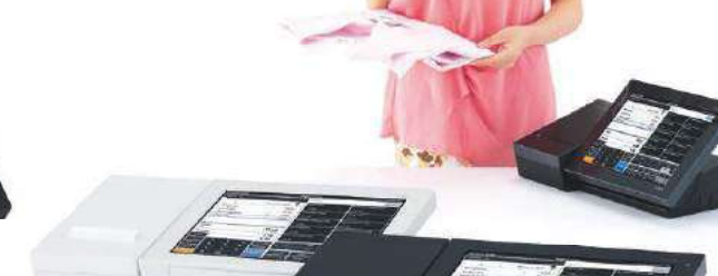
▲LCD screen in flat position