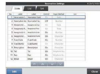
▲Customer management application

V-R100 will enable customer management without using a separate PC. It can be used to analyze store visit frequency and consumption amount by customer, and prepare customized customer list. Also the simple built-in reservation system will provide convenient store operation.