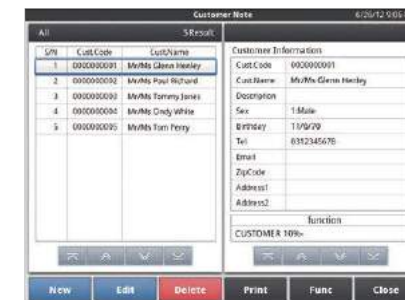
▲Reservation management application