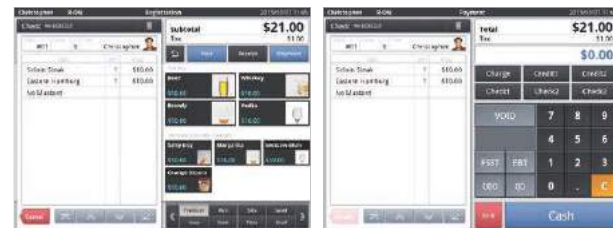
▲New simple type application

Casio has a long history of supplying cash register products. V-R100 can select from two types of sales management application. One is the traditional type for those who are familiar with the cash register operation. The other is a new operation type for inexperienced users. Whichever application is chosen, sales data and stock data can be easily managed and reported.