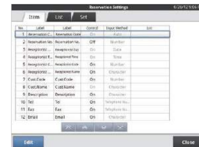
▲Customer management application

V-R100 will enable customer management without using a separate PC. It can be used to analyze store visit frequency and consumption amount by customer, and prepare customized customer list. Also the simple built-in reservation system will provide convenient store operation.