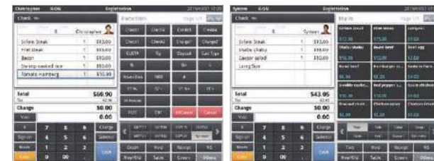
▲Standard type application