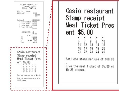
▲Electronic stamp card

V-R100 has a simple point stamp card system which enables to print on the receipt. A voucher can be issued according to the number of store visit. This feature will help provide better service for preferred guests.