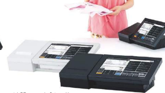
▲LCD screen in flat position