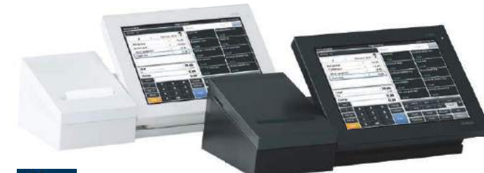
▲LCD screen in upright position

V-R100 is very compact. Small footprint will enable to fit in any places. The slim and stylish design will match every store atmosphere. V-R100 has been awarded in various design awards such as IF design award 2013 and German Design Award 2014.