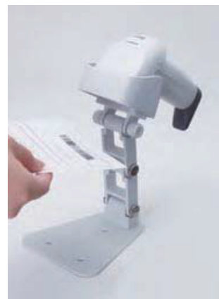
H-9500-W ( White )