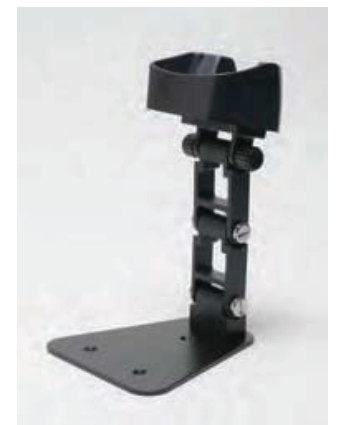
H-9500-B ( Black )

Contact Us: If you have further enquiries, please contact us for more information & discussion.